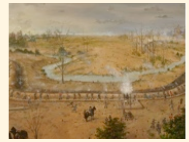
12,000 Year History Park Cayce, SC