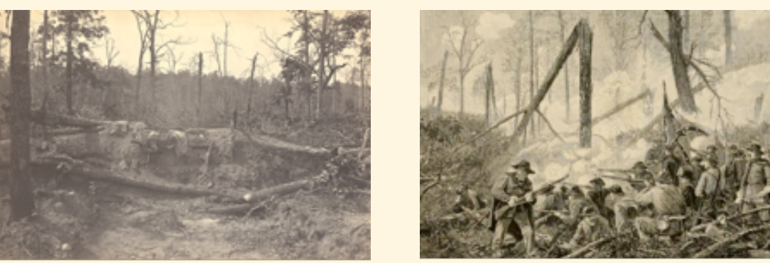
The battle was fought in rough terrain with many soldiers using logs or headstones for cover

A small park and "Battle of New Hope Church" interpretive marker (# 19) bear witness to the carnage