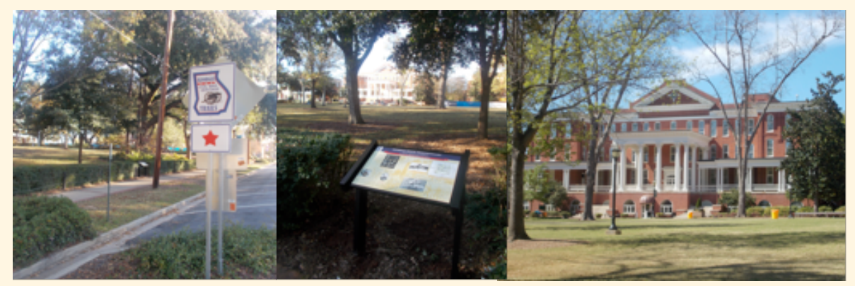
Site of the "Georgia State Penitentiary" (marker # L15) is today home to Georgia College

Follow the Civil War Heritage Trails * www.CivilWarHeritageTrails.org * Facebook * Twitter * YouTube * Pinterest