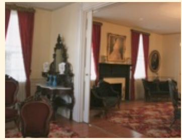
First Confederate White House Montgomery, AL

South Carolina: Secrets from the Grave & Moonlight Cemetery Tours - Thursday, July 11, 7:30 to 9:30 pm, Elmwood Cemetery, 501 Elmwood Avenue, Columbia SC. 160+ years of history come to life during our popular Cemetery Tours. Grab your flashlight as we tour one of Columbia's oldest cemeteries and discover centuries of stories etched on the markers and headstones. Included are hundreds of Confederate veterans. Choose from two tour options: 1) Secrets from the Grave Tour @ 7:30 pm, or 2) Moonlight Cemetery Tours @ 8:00 & 8:30 pm. Tickets: Adults $15.00, Youth $7.00. 803-252-7742, www.historiccolumbia.org/events/